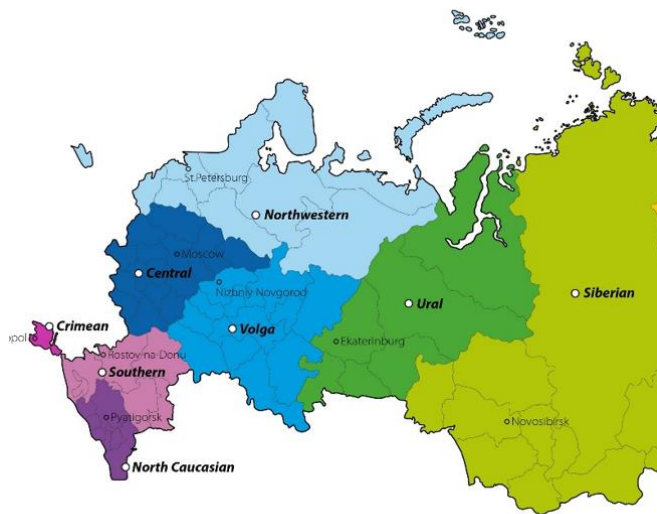
Map with the major Federal Districts of Russia